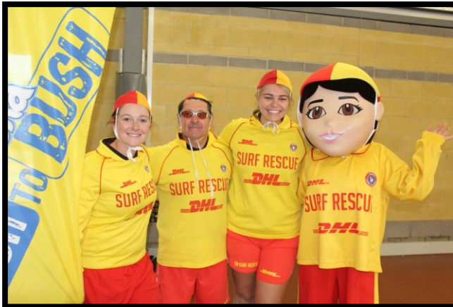
Beach to Bush visited on Monday